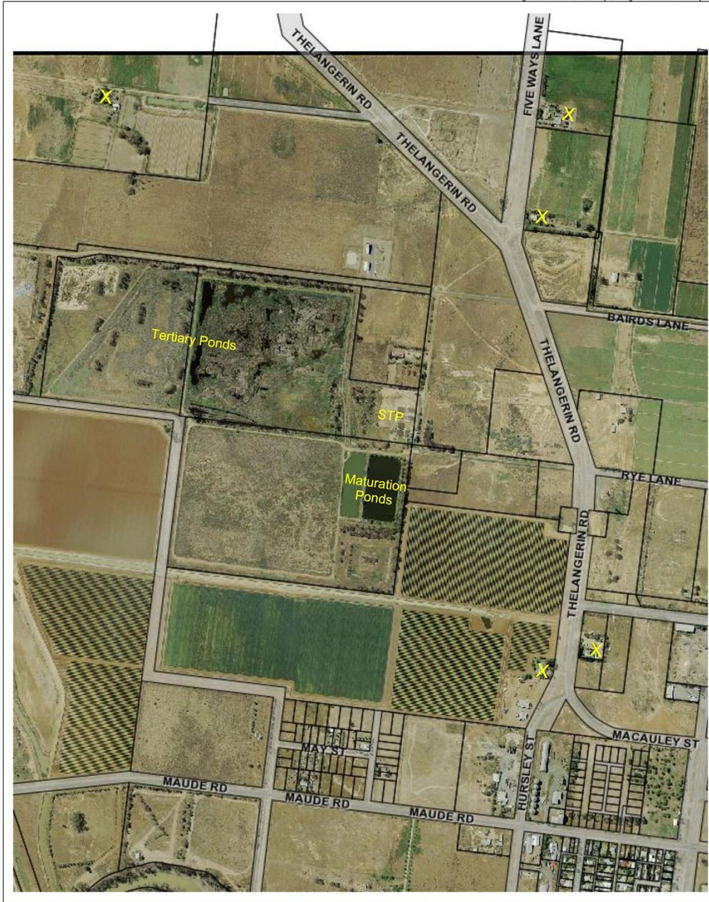
Figure 3 - Location of Hay Sewage Treatment Plant (STP)