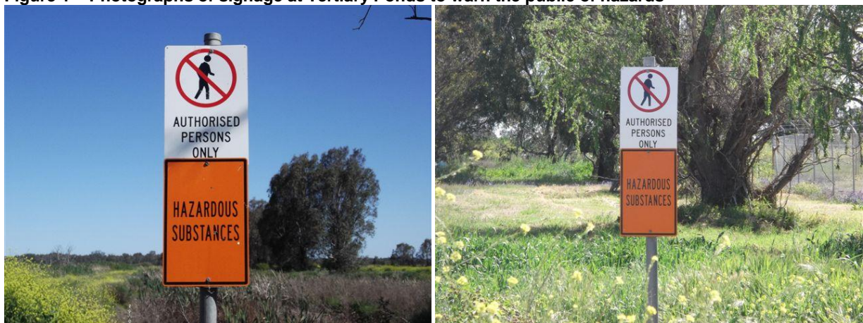
Figure 1 – Photographs of signage at Tertiary Ponds to warn the public of hazards

The tertiary ponds attract wildlife and subsequently the public occasionally access the site to observe wildlife. Prohibition signage has been installed at the tertiary ponds to warn the public of the hazards. Photographs of this signage are below.